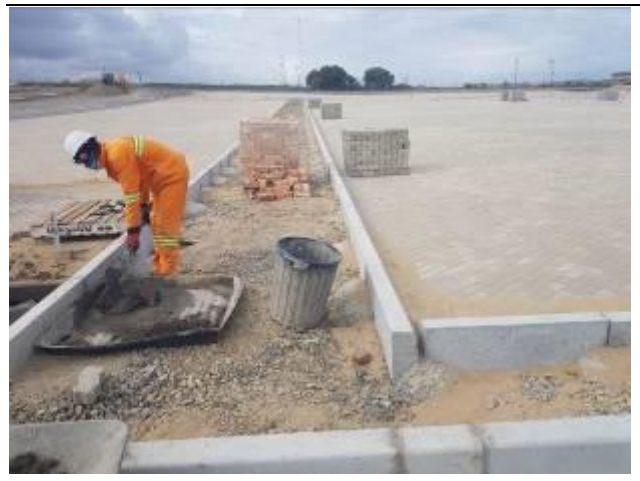
Image 19: Mixing of cement on an impermeable surface with a waste receptical close by.