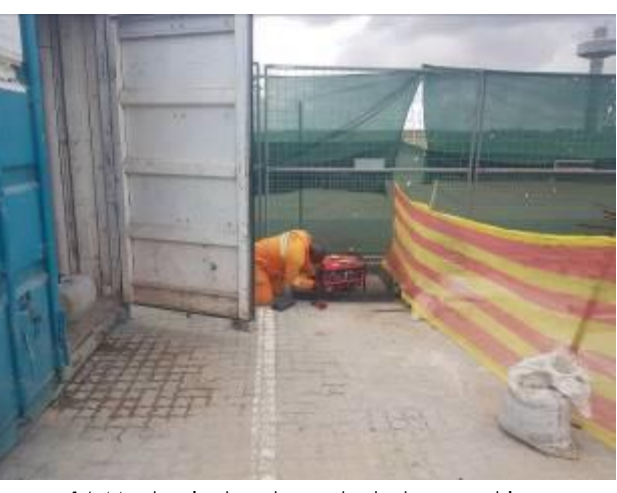
Image 14: Mechanical work conducted on machinery within the site camp, on an impermeable surface.