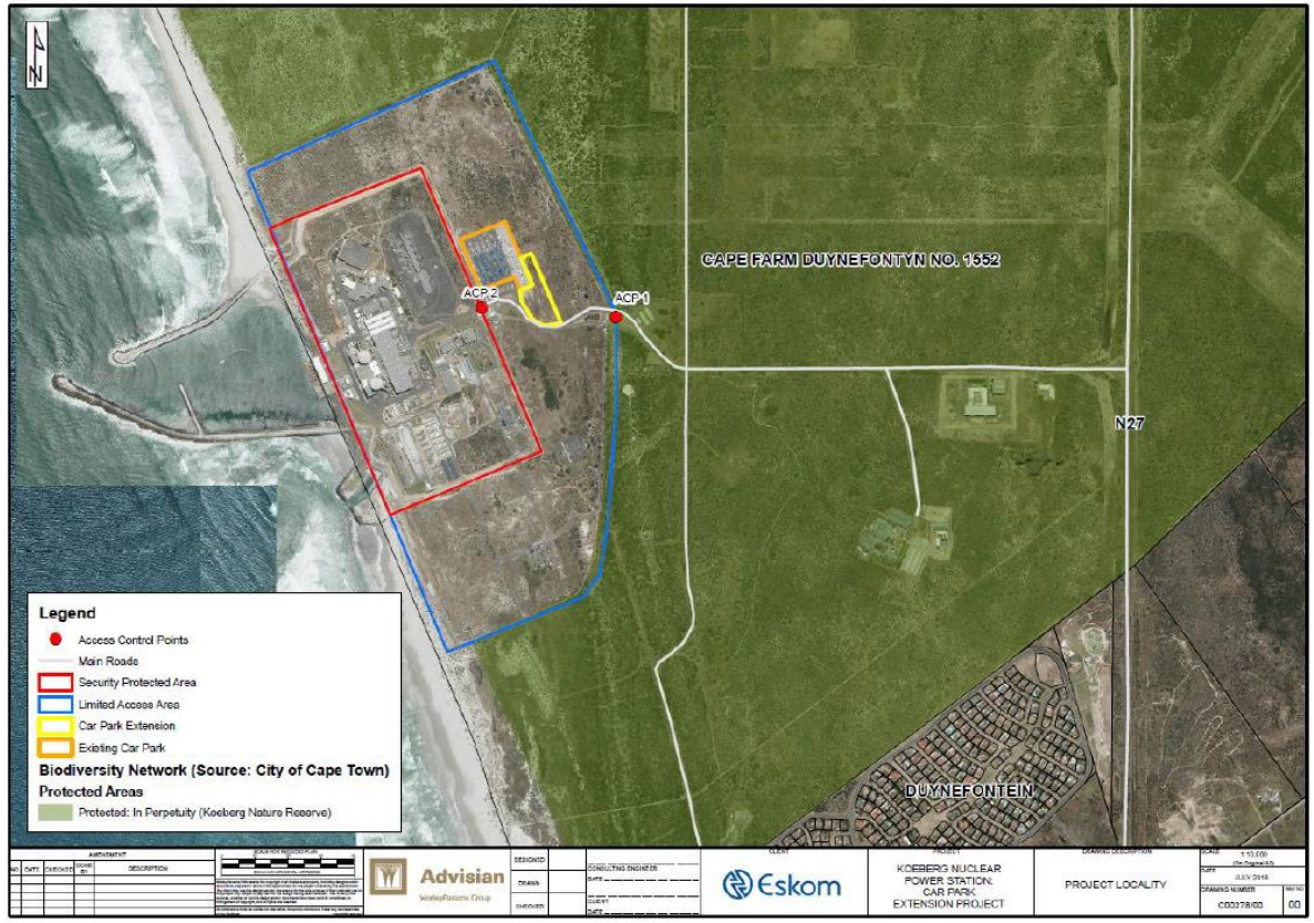
Figure 2: Site locality within Koeberg Nuclear Power Station.