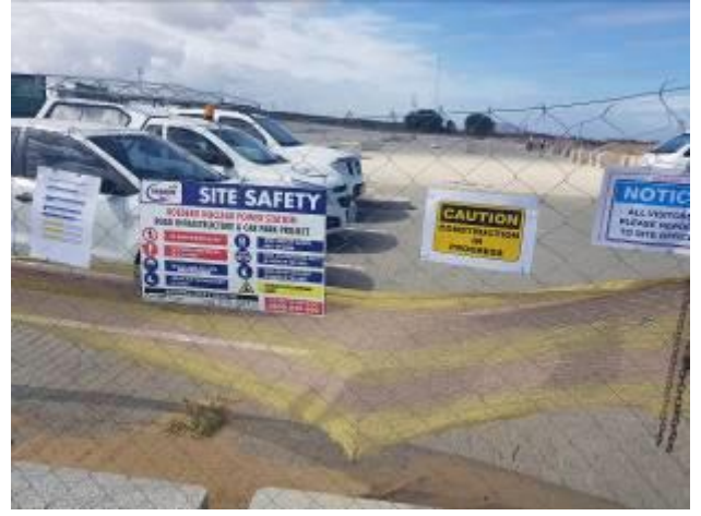
Image 25: Site notice informing members of KNPS of the presence of a construction site.