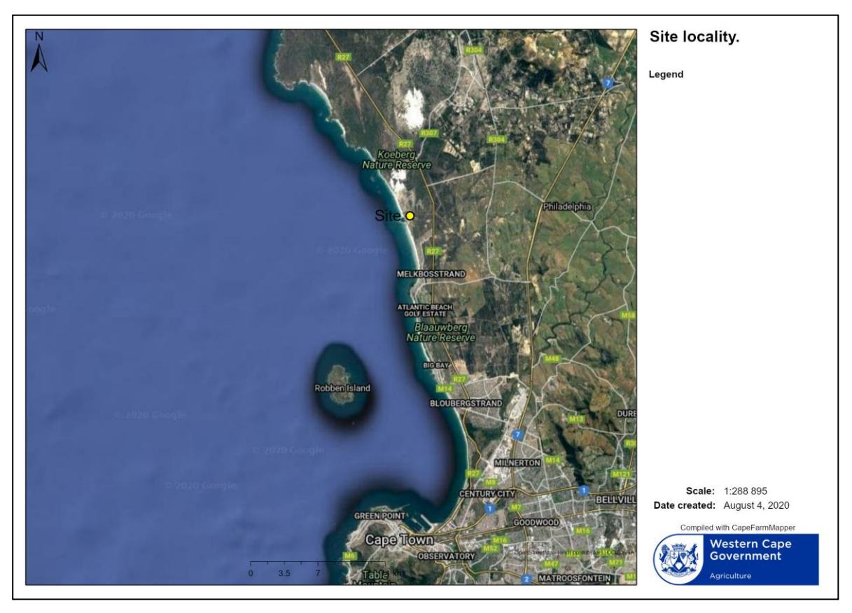
Figure 1: Locality of Koeberg Nuclear Power Station (site).

• Cape Farm Duynefontein No 1552, portion 0